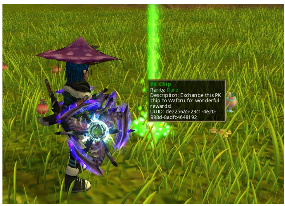
(PK Chip drop)

After the update, the current Karma rank and the nickname color change that is related to this will be reset on all characters. Also, the monsters on the PK channel will have a chance to drop a new item called "PK Chip" when you defeat them.