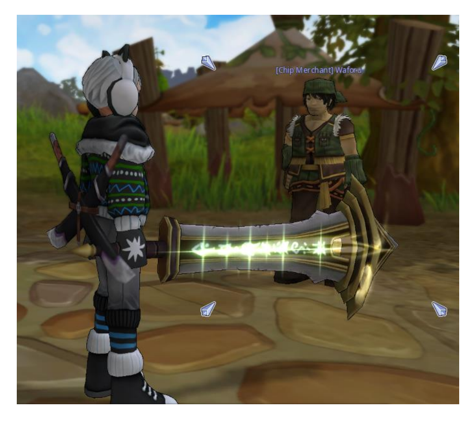
(PK Chip Exchange NPC)

IMPORTANT NOTE: 'PK Chip' can only be stored in your inventory. 'PK Chip' can be used by exchanging with the appropriate NPC, much like the Guild Siege Chips. Examples of prizes that will be available are items that change name color, various new cosmetic glows, a ticket to Kebaras, and more in the future!