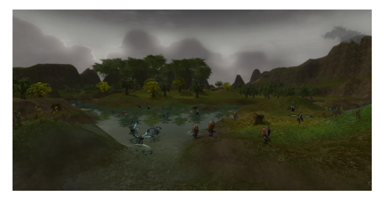
You will be warped immediately to the area after you use the ticket.

The ticket has a maximum use time before it expires. You can view the remaining time in the tooltip of the ticket item. When your use time is up, you will be automatically expelled from the Ticket Area. (Therefore, when you are expelled suddenly, that means your ticket use time is up!)