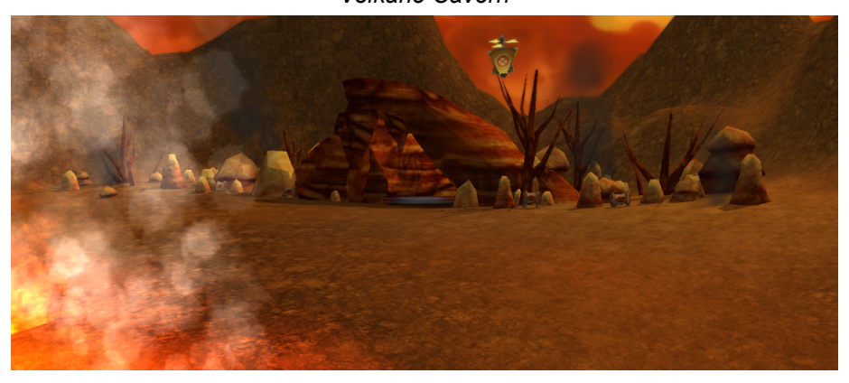
Volkane Cavern entrance in Magmient